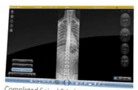
Completed Spinal Stitching Study